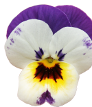
Jolly Face VC0103R/E