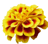
Yellow Fire TP0609C/D