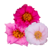
Valentine Mix PG2297R/U