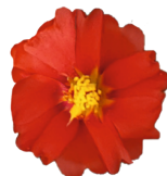
Deep Red PG2212R/U