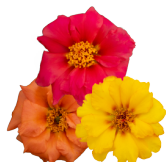
Volcano Mix PG2296R/U