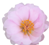
Light Pink PG2208R/U