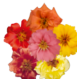
Peach Mix PG2295R/U