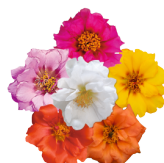
Caliente Mix PG2298R/U