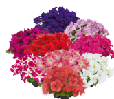
Maxi Mix PH0499P