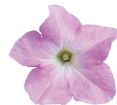
Light Pink PH0404P