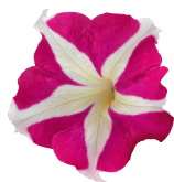
Rose Star PH0407P