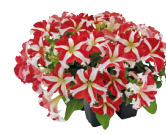
Red Star PH0512R/P