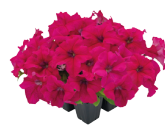
Deep Rose PH0504R/P