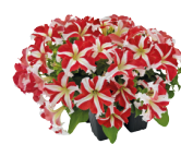
Red Star PH0512R/P