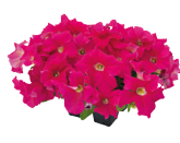
Deep Pink PH0513R/P