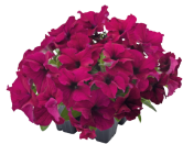
Burgundy IMPROVED PH0508R/P