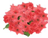
Deep Salmon PH0502R/P