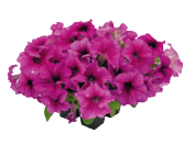
Burgundy Vein PH0510R/P