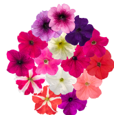
Maxi Mix PH0599R/P