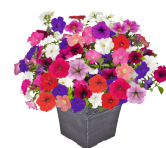
Maxi Mix PH0199P