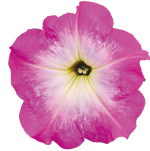
Pink Morn PH0114P