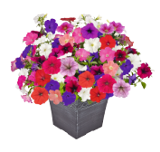
Maxi Mix PH0199P