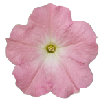
Light Pink Morn PH0118P