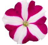
Magenta Star PH0115P