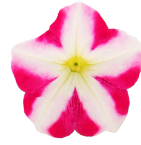
Rose Star PH0116P