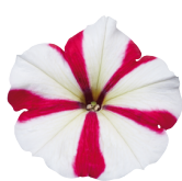
Rose Star PH0317R/P