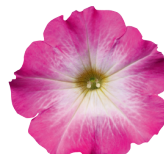
Pink Morn PH0312R/P