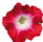
Red Morn PH0315R/P