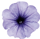
Blue Ice PH0302R/P