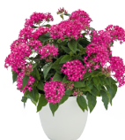
True Pink PL0407P