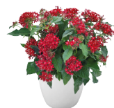
Red Velvet PL0422P