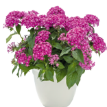
Lavender Pink PL0412P