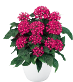
Bright Red PL0419P