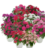
Maxi Mix PL0499P