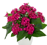
Neon Plum PL0415P