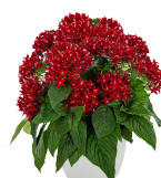
Deep Red PL0413P