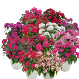
Maxi Mix PL0499P