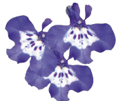
Blue with Eye LE0102R/U