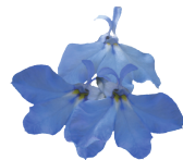
Sky Blue LE0105R/U