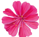
Ruby Red LC0301T