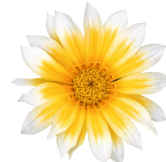
Sunny-Side Up GR0106C