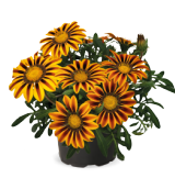
Orange Flame GR0102C