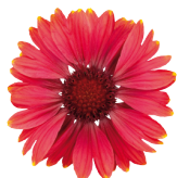
Red Shades GA0103C