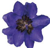
Dark Blue Dark Bee