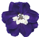
Dark Blue White Bee