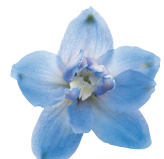
Sky Blue White Bee