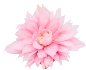
Light Pink BT0701P