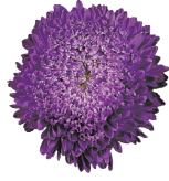
Deep Blue CC0505R