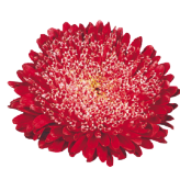
Fiery Red CC0501R