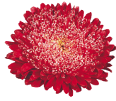
Fiery Red CC0501R