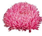
Salmon Pink CC0504R