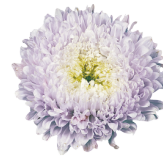
Soft Blue CC0507R