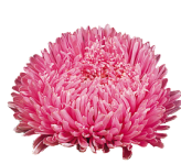
Salmon Pink CC0504R