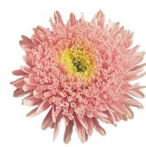
Light Pink CC0405R