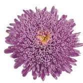
Light Blue CC0404R