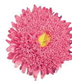
Salmon Pink CC0407R