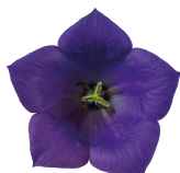
Deep Blue CC2101P