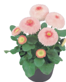
Strawberries & Cream BP0502P