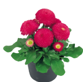
Deep Rose BP0501P