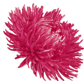
Carmine Rose CC0202R