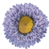
Light Blue CC0602R