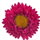
Deep Rose CC0606R