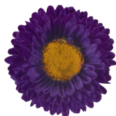
Deep Blue CC0605R