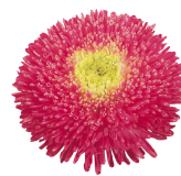
Bright Rose CC0306R