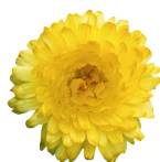
Light Yellow CO0103R