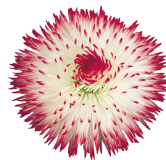
White Red Tips BP0704P