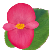
Rose Green Leaf BB0107P