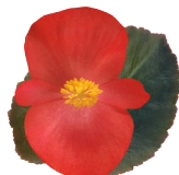
Red Bronze Leaf BB0110P