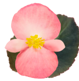
Pink Bronze Leaf BB0105P