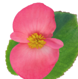
Deep Pink Green Leaf BB0113P