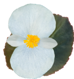
White Bronze Leaf BB0112P