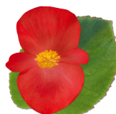
Red Green Leaf BB0106P