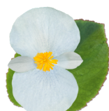
White Green Leaf BB0114P