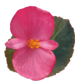
Deep Rose Bronze Leaf BB0108P