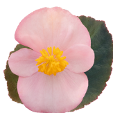
Soft Pink Bronze Leaf