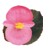
Rose Bronze Leaf BB0109P