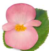
Pink Green Leaf BB0103P