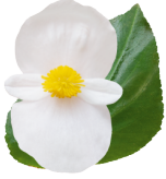
White Green Leaf BB0207P