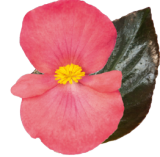
Rose Bronze Leaf BB0205P