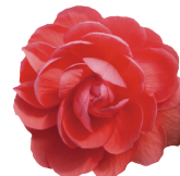
Salmon Pink BT0802P