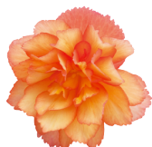
Golden Picotee BT0801P