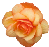
Apricot Shades BT0803P