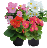
Mix (excl. Blush) BS0499P