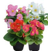
Mix (excl. Blush) BS0499P