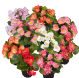
Maxi Mix BS0299P