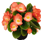
Orange Bicolor BS0202P