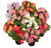
Maxi Mix BS0299P