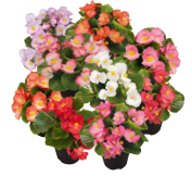
Maxi Mix BS0299P