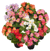
Maxi Mix BS0299P