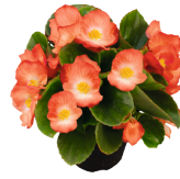
Orange Bicolor BS0202P