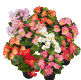
Maxi Mix BS0299P