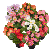
Maxi Mix BS0299P