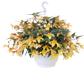
Mellow Yellow BB5107P