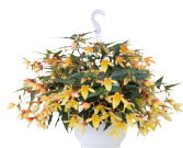
Mellow Yellow BB5107P