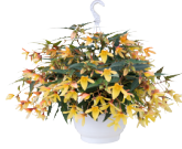
Mellow Yellow BB5107P