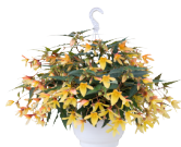
Mellow Yellow BB5107P