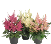
Mix (incl. Pink) AA0199P