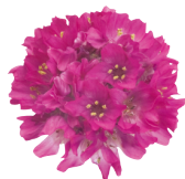
Deep Rose AM2001R